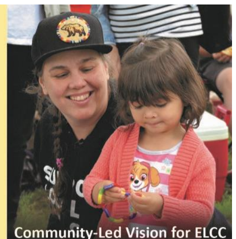
Community-Led Vision for ELCC