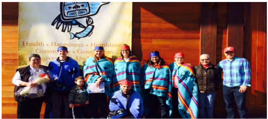
Bringing Tradition Home participants

604-913-9128 ext. 227 or lani@acc-society.bc.ca