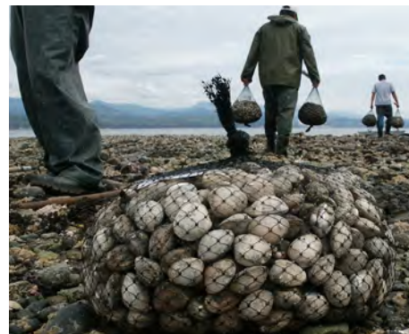
Clam collecting

Wear a green ribbon on May 19th to show that you support the call for reliable funding and resources to ensure quality, culturally relevant AECDC!