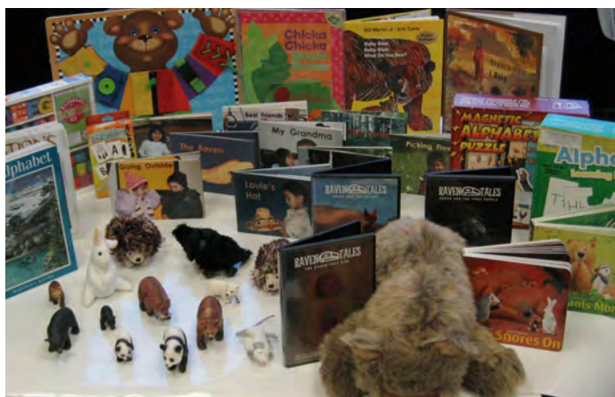
CURRICULUM BOX - Language and Literacy: Alphabet puzzles, Northern Learning to Read Book Series, CDs, wordless books, bannock bingo and poster, Connect-the-Letter tracing activity, The Spirit of Learning CD, Bear Snores On book and activity bag, puppets, Zoe and the Fawn book and Activity Bag, DVDs, magnetic letters, picture books.

Deadline to Apply: June 10, 2015 at 4:00pm